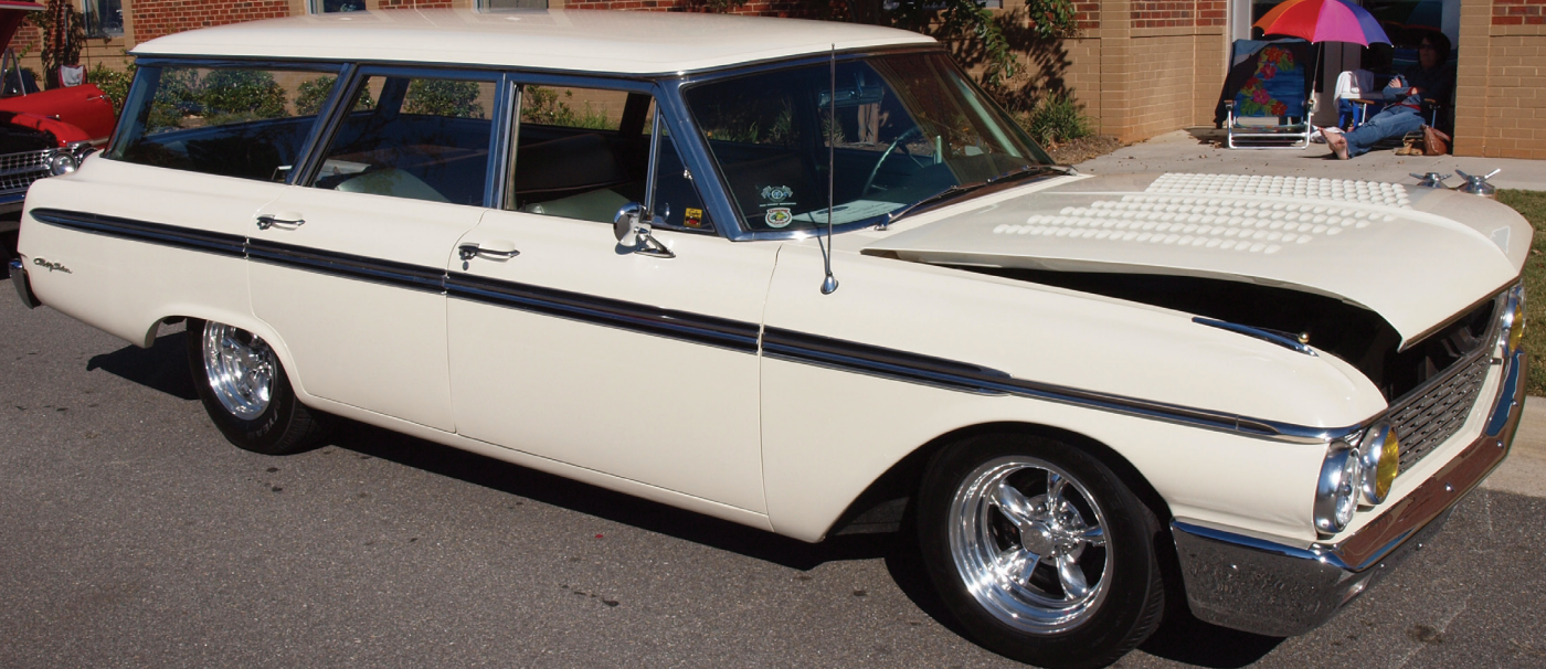
Wagons are COOL! Very nice modified '62 Country Sedan

1966 Galaxie - Emberglo Deluxe Seat Belts: I'm looking for a full set of "deluxe" seat belts for my '66 7 Litre in Emberglo color. Need 2 for front seats (with re-tractors) and 2 for rear. Looking for NOS or clean used examples (not all stained). Please Con-