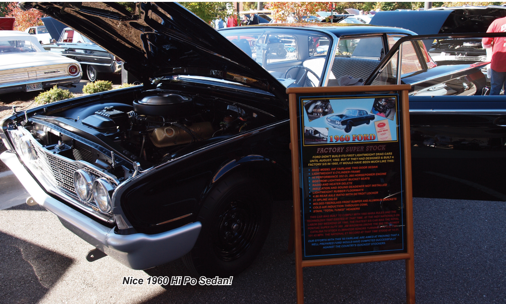
Nice 1960 HiPo Sedan!

1966 390 4dr Galaxie 500 $4,000.00 My pride and joy. E-mail or call for a list of features and items completed. Located in Navarre, FL 850-313-0662 See car at: http://www.galaxieclub.com/ad_cars.html?id=1556 Contact